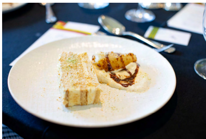
Dessert - medutis (honey cake).