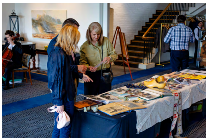
Members looking through the memorabilia.