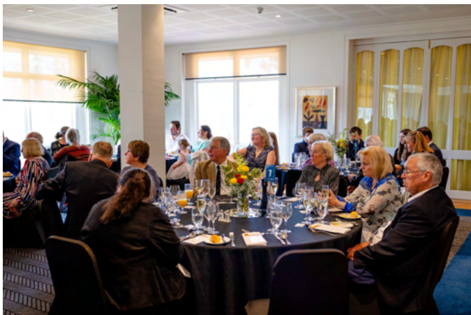
Members listening to speeches.