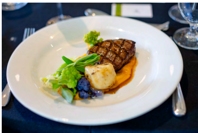
Main - Steak with a cepelinai.