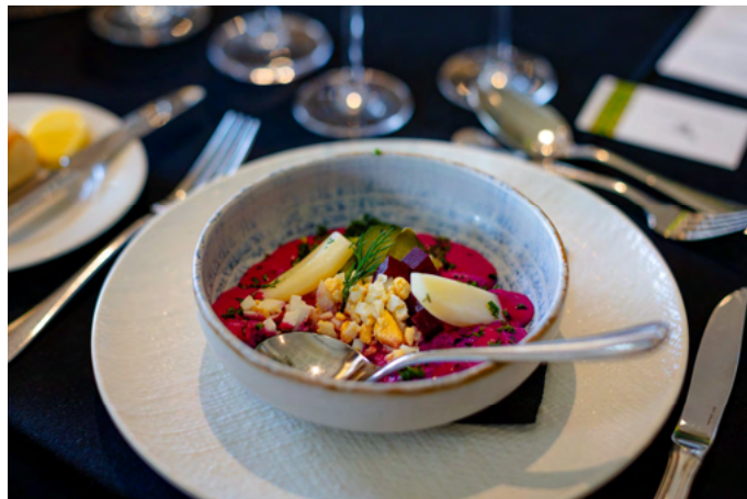
Entree - Šaltibarščiai (cold beetroot soup).