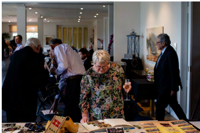
Members looking through the memorabilia.