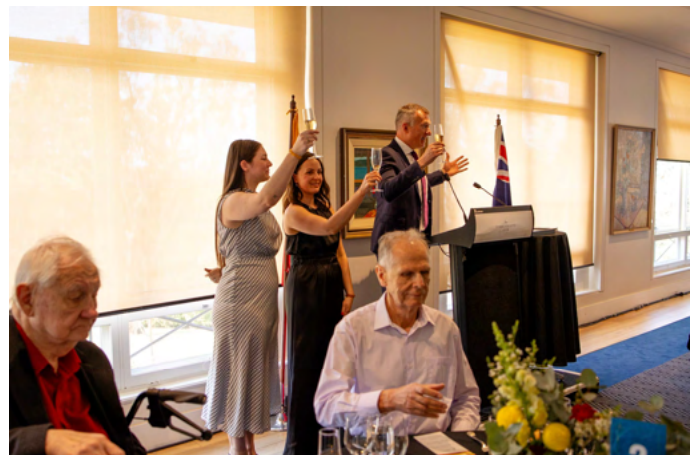
The Ambassador makes a toast to the Canberra Lithuanian Community.